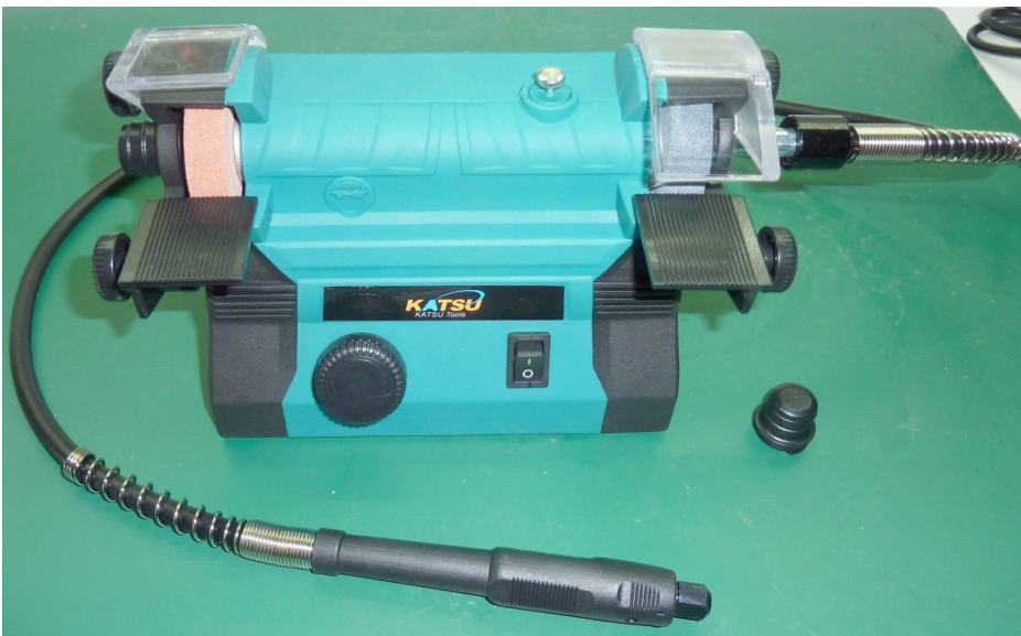
Grinder and flexible connection

The manual says that you can fit a buffing wheel attachment on the outputs. It was not supplied with this tool and I haven't been able to track one down so far. Using a knob on the front you can vary the speed continuously between 3 and 7 000 rpm. There is a slide-out tray for bits.